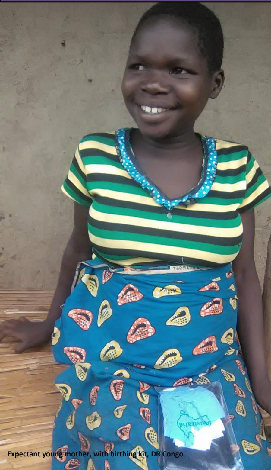
Expectant young mother, with birthing kit, DR Congo