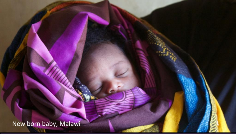
New born baby, Malawi